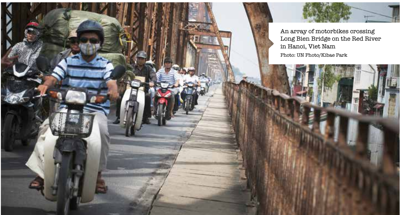
An array of motorbikes crossing Long Bien Bridge on the Red River in Hanoi, Viet Nam

However, in other industries the government has struggled to implement consistent and coherent industrial strategies. There has been little financial support available to SoEs and incentives to improve performance have been relatively weak. Arguably, small and medium sized private firms have been neglected and need more support. 126