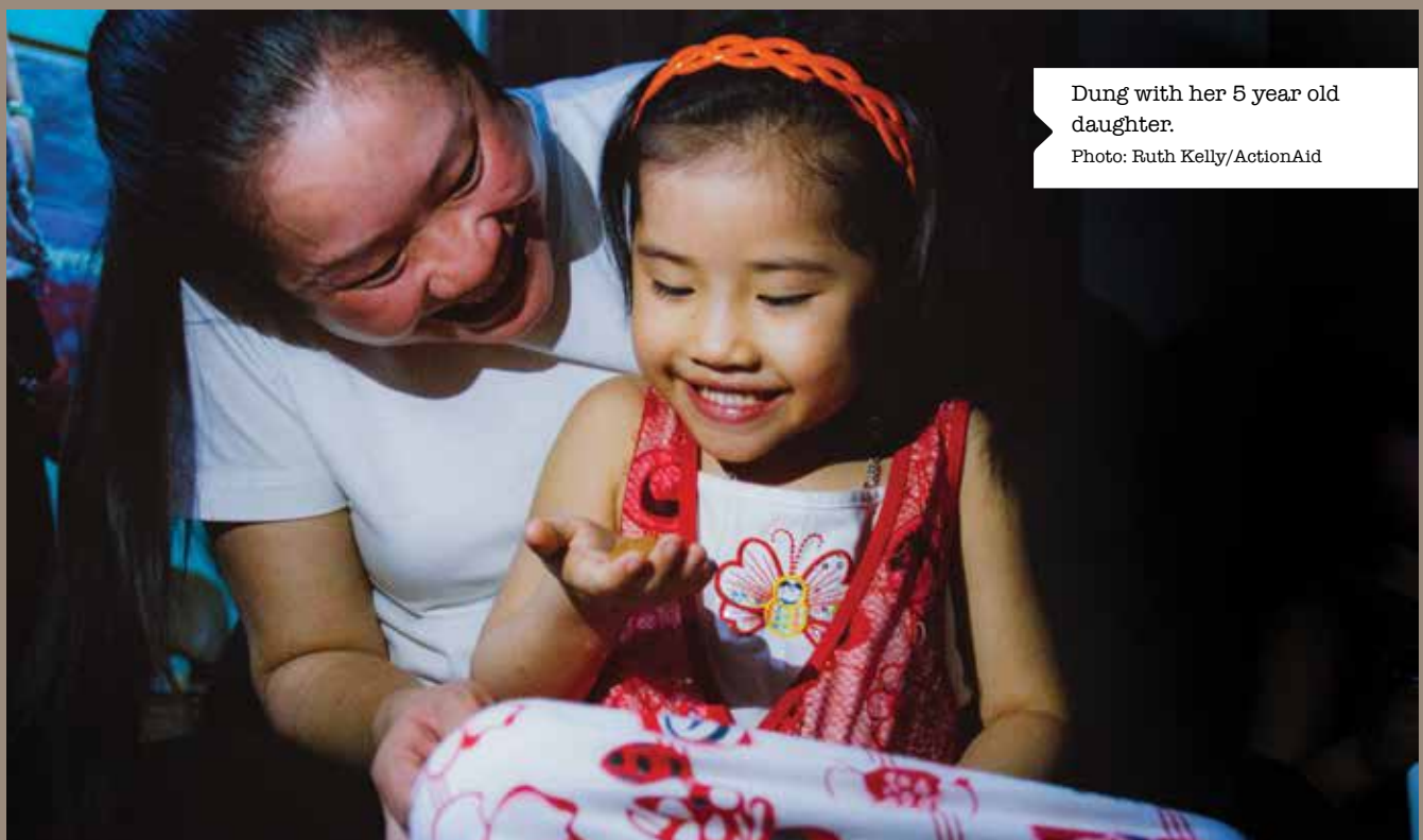
Dung with her 5 year old daughter.

ActionAid and its local partners have established information kiosks near factories and where factory workers live to provide workers with information about their rights. We are currently facilitating discussions among more than 8,000 textile and leather workers and their employers to help workers claim their rights and to encourage companies to improve working conditions.