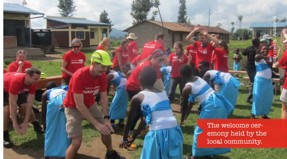
The welcome ceremony held by the local community.

Nine months on, the project has been fully completed and the new classrooms have provided children with a far better environment to learn in.