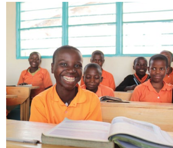
The Rwandan schoolchildren enjoy learning in their new classrooms. •